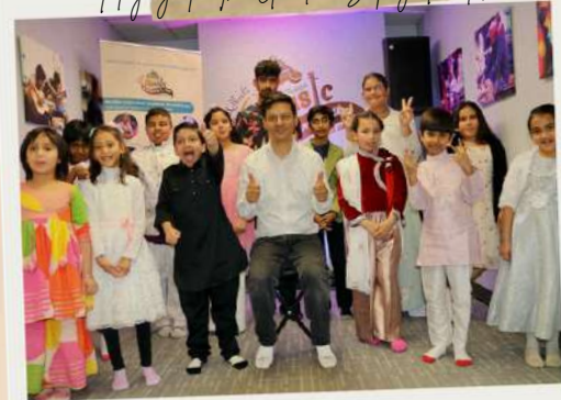
Kids Making Funny Faces with Director