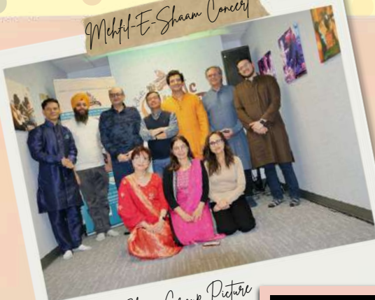
Post-Show Group Picture