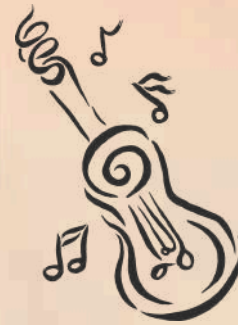
Playing In The Garden Spring Recital