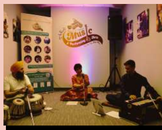
Captivating Rendition by Bishaw KC